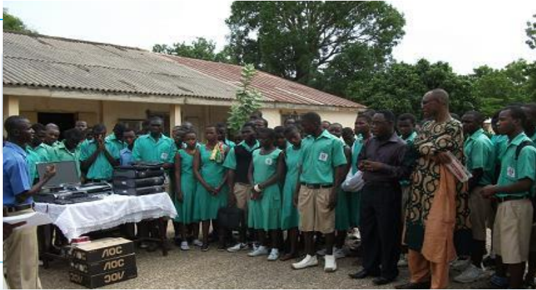
Students of Wa Secondary with computers donated by PIE