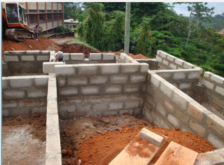
Mfantshipim waste management & power plant under construction. $20K to be funded by specified donations to PIE.