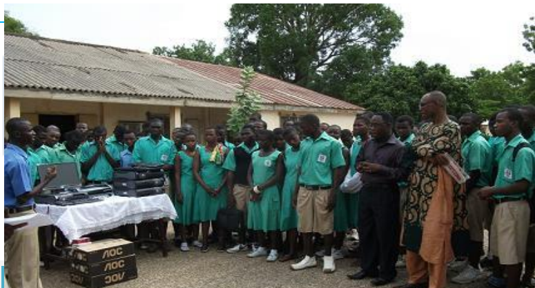
Students of Wa Secondary with computers donated by PIE