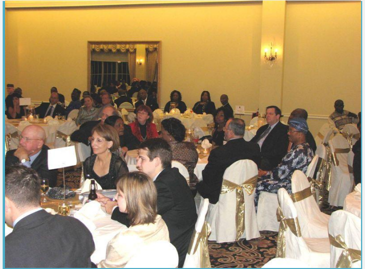
Houston Gala - November 2009